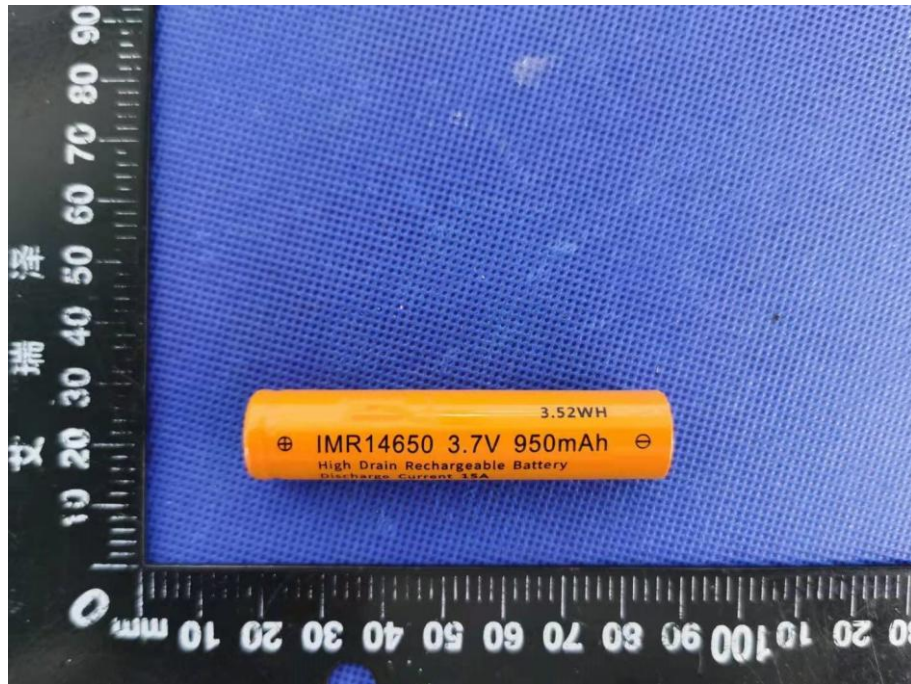
Figure 1 Front view of cell